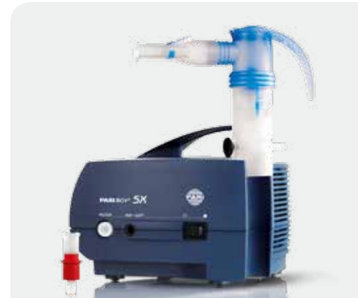
PARI BOY® SX Item No. 085G3001

Inspiratory flow 20 l/min, measurement with the Malvern Mastersizer X (calculated according to the Fraunhofer model) at 23 °C and 50% relative humidity. Nebulised medium: 0.9% NaCl (5 ml).